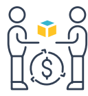
Sales & Marketing