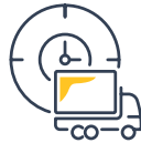
Manufacturing & Operations