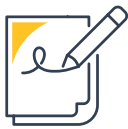
Game Management & Design